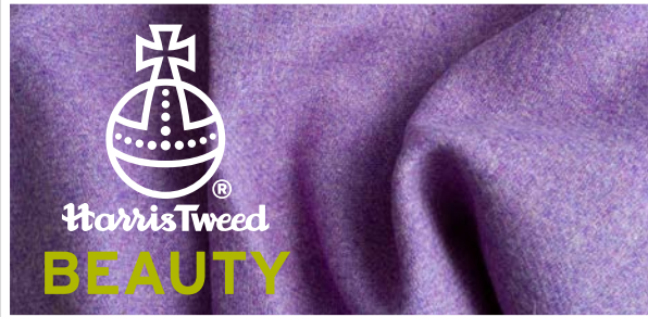
SET A Natural/Beauty