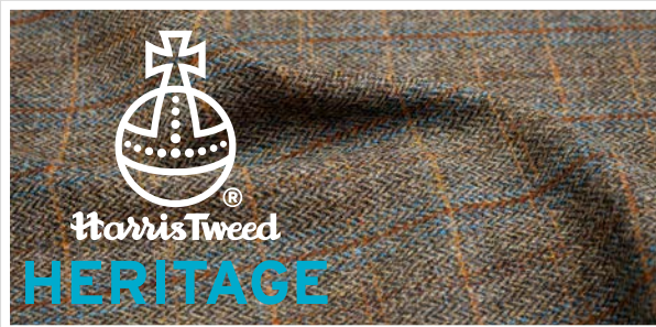
SET C Modern/Heritage