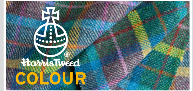
SET B Colour & Pattern