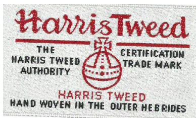
General Purpose Label A (60 x 35mm)