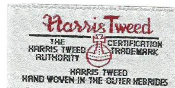
General Purpose Label B (50 x 25mm)