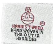
Accessory Label (28 x 25)