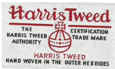
General Purpose Label A (60 x 35mm)