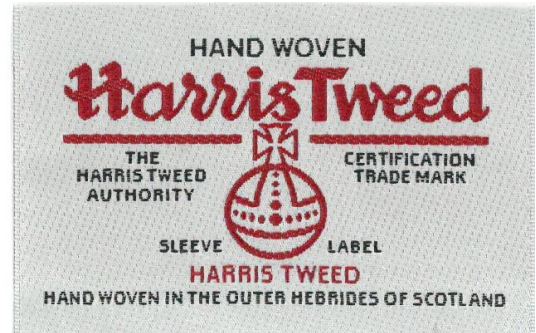
Sleeve Label (80 x 55mm)