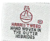
Accessory Label (28 x 25)