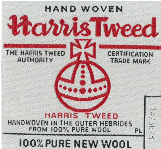
Standard Label (80 x 80mm)