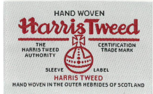
Sleeve Label (80 x 55mm)